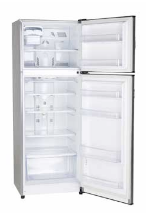
Figure 5: Double-door fridge-freezer

A double-door refrigerator-freezer has at least one compartment suitable for the storage of fresh food and at least one other suitable for the freezing of fresh food and the storage of frozen food under three-star storage conditions (-18°C). The two compartments are accessible independently from two doors on the front.