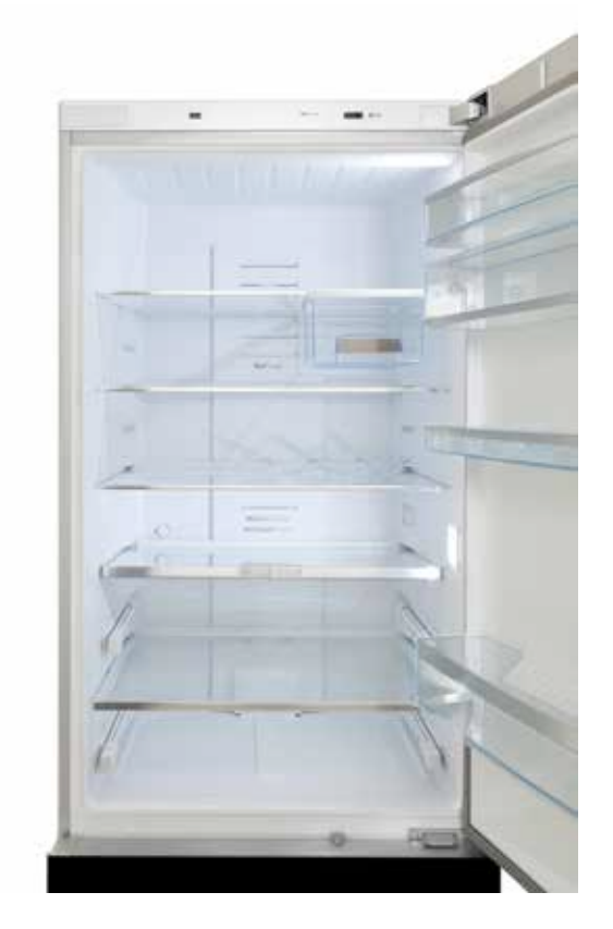
Figure 3: Single-door refrigerator without freezer

This type of refrigerator is characterized by one or more compartments suitable for the storage of fresh food, which is/are accessible from one single door on the front.