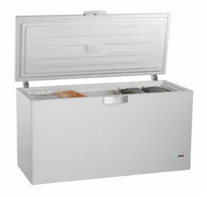
Figure 7: Chest freezer

Food freezers have one or more compartments suitable for freezing foodstuffs from ambient temperature down to a temperature of -18°C and are also suitable for the storage of frozen food under threestar conditions (Bhide 2010). In the case of the chest freezer type, the compartments are accessible from the top. Compared to upright freezers, chest freezers are usually more energy efficient, especially because less cold air escapes while the top-mounted door is open (energystar.gov).