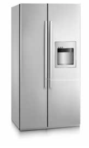
Figure 2: Refrigerator, freezer, refrigerator-freezer

Appliances vary greatly in their configurations and the range of options.