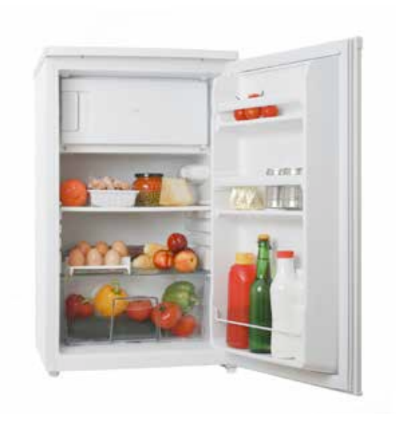
Figure 4: An energy-efficient single-door refrigerator with freezer

A refrigerator-freezer has at least one compartment suitable for the storage of fresh food and at least one other suitable for the freezing of fresh food and the storage of frozen food under three-star storage conditions (-18°C).