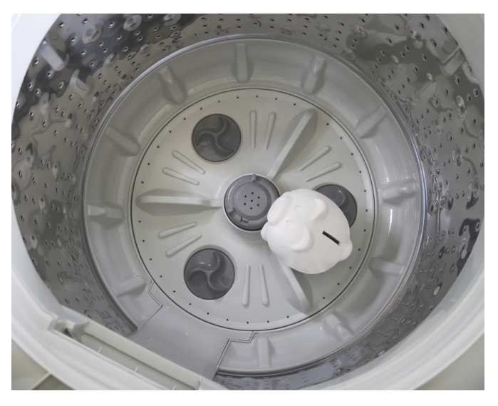
Figure 5: Vertical axis 'high-efficiency' washing machine, Impeller

In impeller washing machines the textiles are substantially immersed in the washing water. The mechanical swirl-action is produced by a device, which is variously named by different manufacturers as impeller or 'pulsator', rotating about its axis continuously or which reverses after a number of revolutions (see Figure 5). During operation, the uppermost point of this device is substantially below the minimum water level (EN 60456:2005 / Faberi et al. 2007). This type of washing machine is traditionally designed as a top-loading device (accessible from one single door on the top). If cold water is used, the energy consumption per wash cycle is low. However, although vertical axis impeller machines are usually not