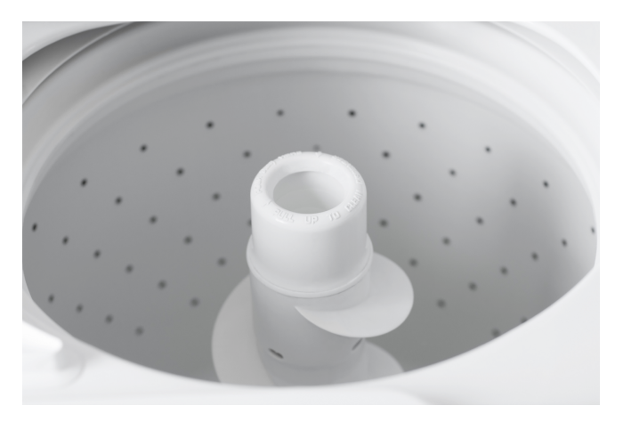
Figure 4: Vertical axis washing machine, Agitator

If cold water is used, the energy consumption per wash cycle is low. But although the majority of washing machines in North America are vertical