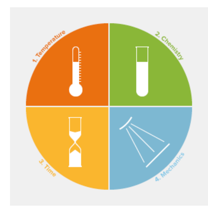
Figure 1: Sinner Circle, parameters of cleaning performance (In washing machines the mechanical action is provided by the drum, agitator or impeller movement).