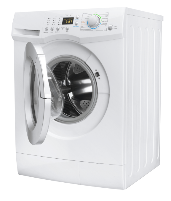
Figure 2: Horizontal axis washing machine, Front load configuration,

Modern washing machines with horizontal axis technology have an automatic load sensing function in order to reduce water and electricity consumption in response to consumer loads that are smaller than the rated capacity. Horizontal axis machines are gaining market shares in almost all markets worldwide (Pakula / Stamminger 2010).